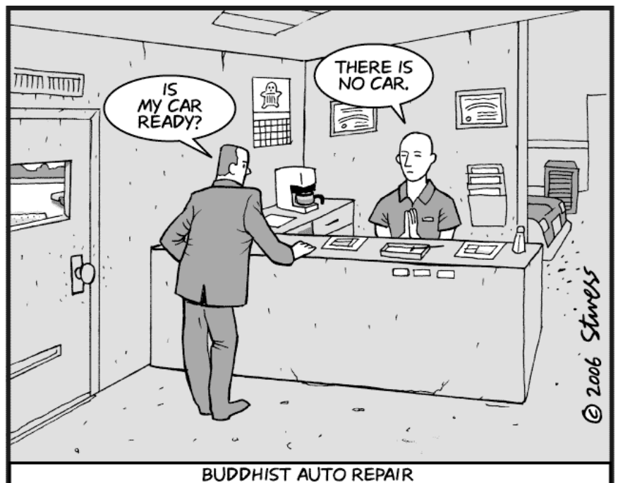
WWW.MARKSTIVERS.COM/CARTOONS, USED WITH PERMISSION