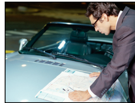
Above: This car will be converted to electric motors by the end of the week Below: Be prepared for serious work