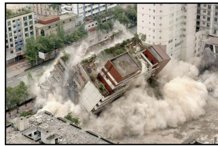
Pierce-Dempsey Construction Project. Experiences Slight Delay.

Art Space will be held in Jamestown, while Folk Music will